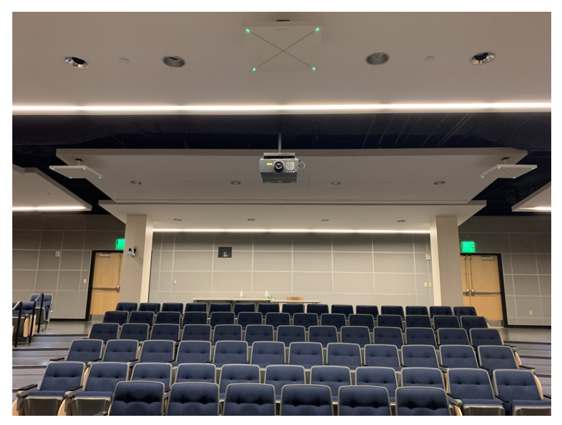
Middle Tennessee State University Upgrades Hybrid Classroom Audio with Sennheiser as "The New Standard" Across Campus

The public university outfitted 250 classrooms with TeamConnect Ceiling 2 microphones to improve audio quality for hybrid students, while streamlining setup for AV staff and educators