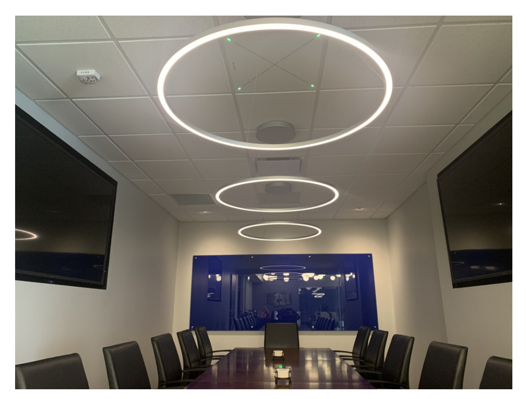
The TeamConnect Ceiling 2 blends seamlessly in the conference rooms on campus

Outside of the classroom use case, the TeamConnect Ceiling 2 microphones are also being used in conference room environments on campus. Specifically, these were selected for audio in the Vice President and Provost's conference rooms, successfully enabling a natural and flexible audio experience for hybrid meetings happening amongst the university's leadership and faculty.